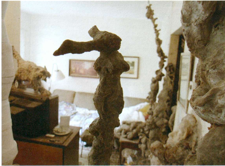
Livingroom, Autumn 2006.

highly orchestrated. Artists making staged and digitally manipulated photographs are challenging photographic “truth,” and others are using film to further this idea.